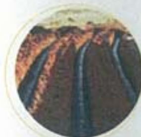
Ideal for contoured applications.