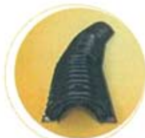
Integral articulating joint.