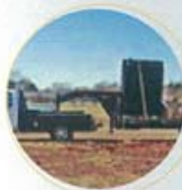
Easily transported to the job site.