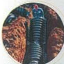
Convenient five-foot lengths are easy to handle.