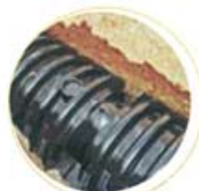
Superior joint design for ease of assembly.