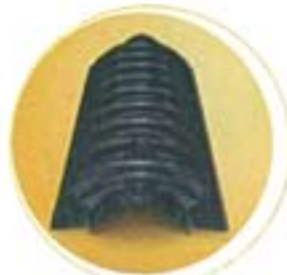
Injection-molded, lightweight and sturdy design.

Now you can save labor, time on the job, and materials with the Arc 36 chamber without sacrificing performance.